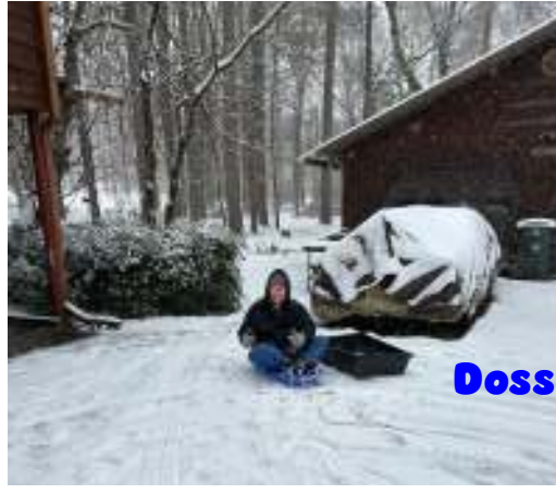
Doss Family Fun