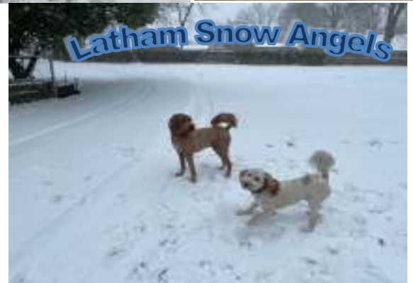
Latham Snow Angels