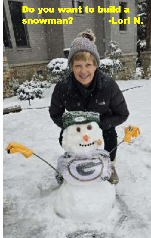
Do you want to build a snowman? -Lori N.