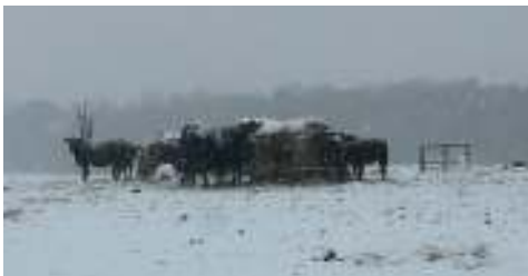
"Moo Snow?" -Holder's herd